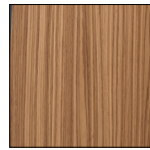
Wood Veneer Cabinet