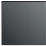
Black High Gloss Cabinet

With the wood veneer housing: 4 matt finishes for the front panel: Ivory, Warm Taupe, Gauloise Blue, Dark Grey.