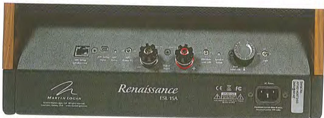
At left are an RJ45 socket for connection during room tuning, a miniUSB input for computer connection and an ARC switch. At right of the input sockets lie a small toggle switch for crossover level adjustment and at far right a light switch.

Why? Well LP via this system had drier and seemingly deeper bass than digital. The vast power of the Renaissance bass enclosures best utilised it. LP bass usually has more bloom than digital bass, but here spinning old 1980s, hi-cut disco 12in singles like Billy Ocean's 'Get Outta