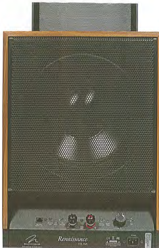
The bass cabinet houses a 12in bass unit behind a protective mesh grille. Below are single input terminals, so the panel cannot be split from the bass unit. There is a bass level control knob and an array of switches.

The bass cabinet houses two Class D 500 Watt Icepower amplifiers, one per drive unit, plus a