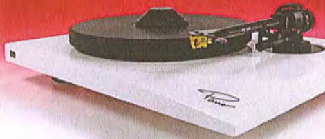
ORACLE PARIS MkV EXCLUSIVE! turntable