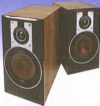
DALI OPTICON 2 loudspeakers