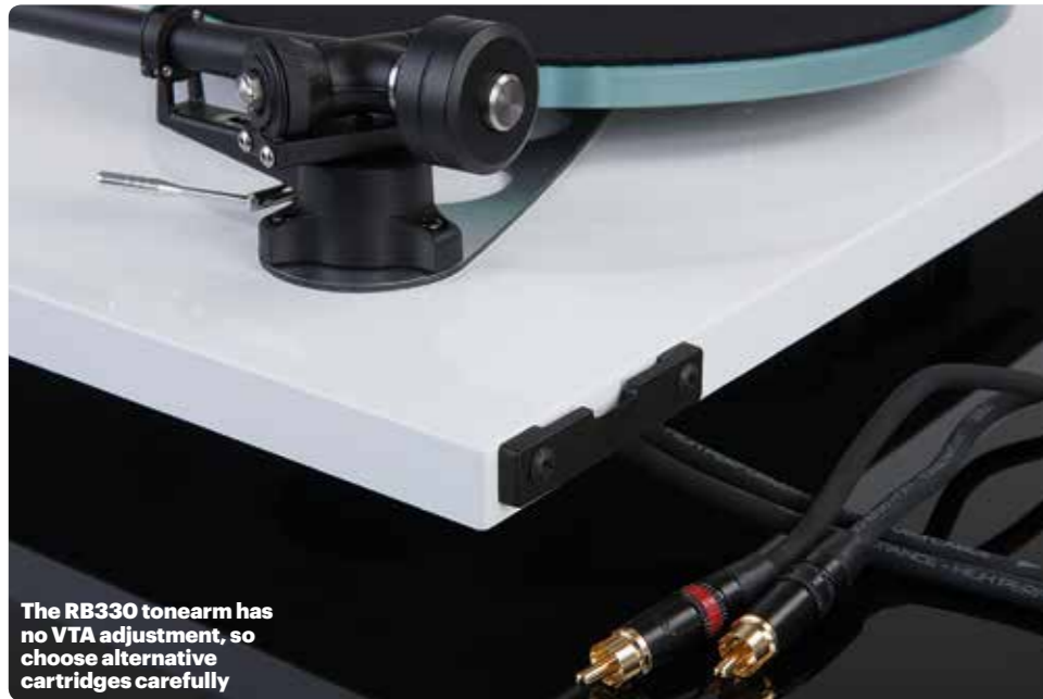
The RB330 tonearm has no VTA adjustment, so choose alternative cartridges carefully

the stiffer plinth, the Planar 3 is considerably more inert than any previous version, which should audibly reduce distortion.