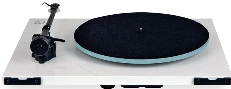
ABOVE: Rega's AC motor is driven by a wall-plug 24V power supply. A fixed pair of phono (RCA) cables exit from the base of the latest RB220 tonearm

of Nu Era's 'Lines Between Us' [from Geometricks EP ; Omniverse OMNI1201] showed me that little has changed in terms of the Planar 2's overall balance. The latest deck to carry the name remains smooth but a little dry – it certainly doesn't offer any extra coloration to sweeten the musical pill, and this might disappoint some analogue addicts. Bass is a little light in absolute terms, too, although certainly no worse than price rivals.