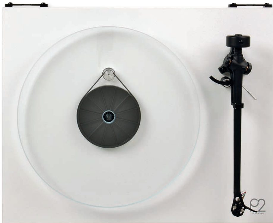
RIGHT: The Planar 2's acrylic-laminated plinth hosts an AC motor mounted at 12 o'clock under a glass platter. Its RB220 tonearm comes fitted with a Rega Carbon MM pick-up

As ever, you change the speed by moving the belt on the pulley even though this means you have to remove the platter. The main bearing is a new 11mm self-securing brass affair, which is said to offer lower friction and a tighter manufacturing