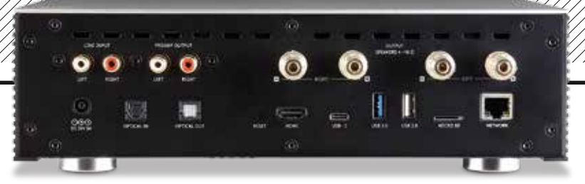
ABOVE: Line in/pre out (RCAs) are joined by optical digital in/outs and 4mm speaker cable terminals. There's an Ethernet port plus one USB-C, micro SD and two USB-A ports for external media and a BT/Wi-Fi dongle. Optional SSD is loaded under the case

adequate for this set, while the slightly soft treble will be preferred by many listeners, and won't aggravate speakers with a slightly over-enthusiastic top-end.