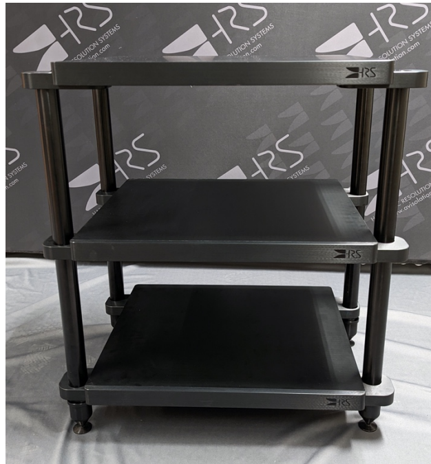
A completed EXR-1921-3V-080-080-B on HRS floor protectors

Step 9. Assembly of the EXR Audio Stand System is now complete. Carefully lift and flip the EXR upright and move it the desired final location for use in your system. Depending on the size of your audio stand this may require multiple people. Make sure to orient the audio stand system so that the front face with the HRS logo(s) faces forward. The stand points should be placed directly on carpeted floors. Place them on HRS Floor Protectors (sold separately) instead if your system is located on wood flooring or another surface you wish to guard against scratching. Please contact your dealer or HRS if you require HRS Floor Protectors.